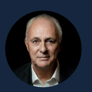
MARK MALLOCH-BROWN PRESIDENT. THE OPEN SOCIETY FOUNDATION | FORMER DEPUTY SECRETARY-GENERAL OF THE UNITED NATIONS